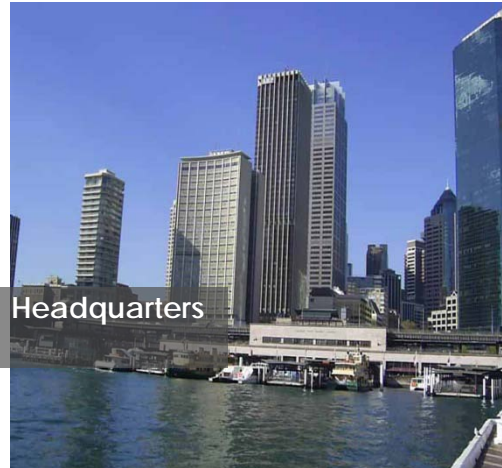
AMP Global Headquarters