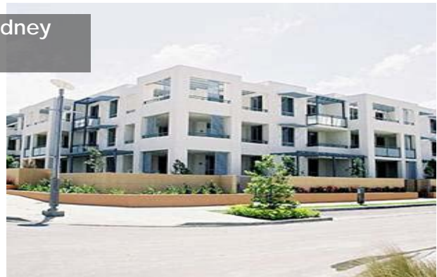
The Waterfront, Homebush Bay, Sydney

Gosford City ESD & Energy Efficiency Policy